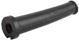
4804.0001 Sleeve black, 5.6 mm