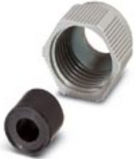
D-SUB cap nut with line seal, for sleeve housing VS-09-..., conductor diameter of 5 mm ... 9 mm

Please be informed that the data shown in this PDF Document is generated from our Online Catalog. Please find the complete data in the user's documentation. Our General Terms of Use for Downloads are valid ( http://download.phoenixcontact.com )