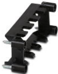
Sleeve frame, without PE, for contact insert modules, type 1, number of insert modules 2

Please be informed that the data shown in this PDF Document is generated from our Online Catalog. Please find the complete data in the user's documentation. Our General Terms of Use for Downloads are valid ( http://download.phoenixcontact.com )