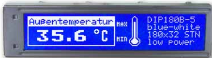
EA DIP180B-5NLW Dimension 102 x 27 mm