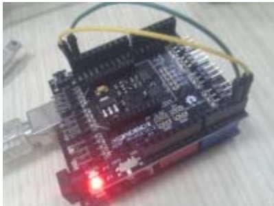
alt fix wiring