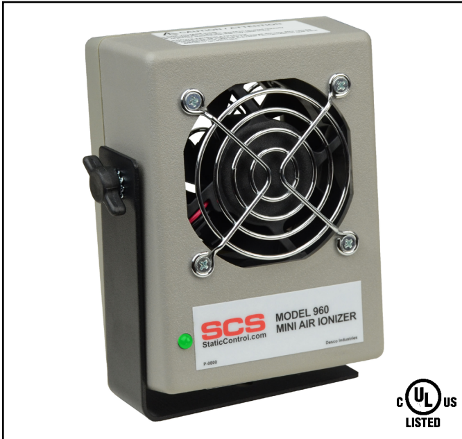
Figure 1. SCS 960 Mini Air Ionizer